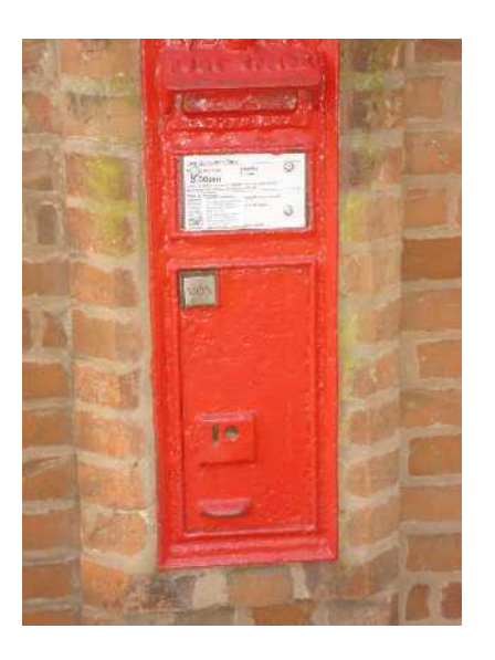
(above) VR wall box at Oversley Green, note the original flap in the aperture is still in place.

(top left) Alcester gold pillar box receiving a first undercoat.