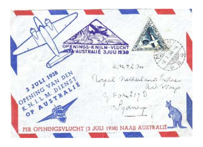
Cover of the opening service Batavia to Sydney 3<sup>rd</sup> July 1938