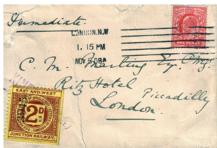
1908 Commercial letter sent from Kineton to London by the EWJ