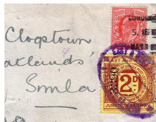
1908 piece from a letter sent from Stratford on Avon to Simla in India via SMJ

Towcester and Midland Junction Railway and the Evesham, Redditch and Stratford-on-Avon Junction Railway to form the Stratford-upon-Avon and Midland Junction Railway (SMJ). Two years later the Northampton and Banbury Junction Railway was also absorbed. The SMJ continued until the national railway re-organisation by the 1921 Railways Act and the SMJ became part of the London, Midland & Scottish Railway Company in January 1923.