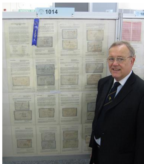
Our proud Chairman at Harrogate standing by his excellent entry on The Penny Posts of Worcestershire