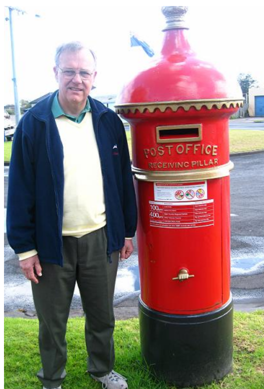
Our Chairman outside the Australian Postal Museum with something akin to a Dalek, but is understood to be a good example of a Post Office Receiving Pillar cast at Bubb & Co Victoria Foundry.

The Anzac display featured original photographs, letters, postcards, medals and memorials. The Australian and New Zealand forces take the remembrance of their war dead very seriously and the displays reflected the honour in which they are held. ( Anzac Day is 25 th April. Ed. ) One wall was taken up with a number of light boxes which showed replicas of stained glass windows from various churches, including one from Malvern! (a suburb of Melbourne). In addition a large flat screen television had a 10 minute video running continuously.