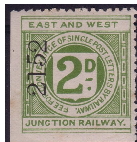
Earliest issue of 2d EWJ Railway stamp.

They ran as required whenever a banana boat docked at Avonmouth. The EWJ was used, as the route was twenty five miles shorter than the along the Midland Railway tracks. Around five trains a week (each with 35 vans) used the route via Broom, often at short notice. The crews of the 'banana' were always in a hurry and did not always observe the 10 mph speed limit for exchanging the token, which was a two feet long heavy metal baton (a Webb-Thompson electric staff). This could come down with force when exchanged clumsily.